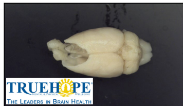
Slide 1 Dorsal View: Showing a surgically induced frontal lobe brain lesion in an un-supplemented control rat.