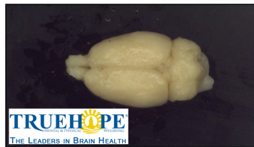
Slide 2 Dorsal View: Showing resulting recovery following a surgically induced brain lesion (same as slide 1 above) Supplemented with the EMPowerplus Advanced ™ formulation